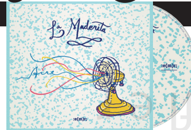
la maderita AIRE E.M.R. ed . 2014