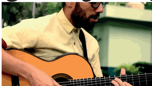
LULÚ live in DF MÉXICO