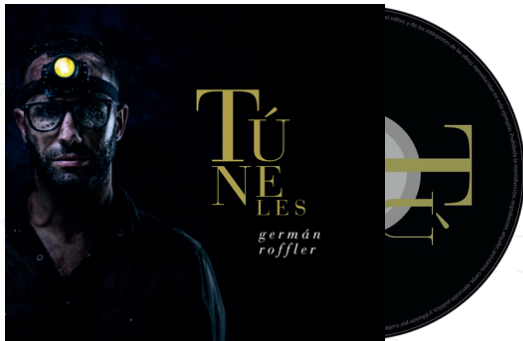
germán roffler TUNNELS (album) . 2021