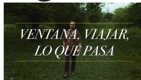
TÚNELES · Video Album