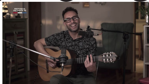
HOME CONCERT for 5RTV Channel