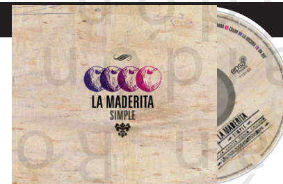
la maderita SIMPLE EPSA. ed . 2010