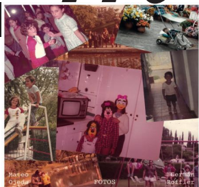
mateo ojeda / germàn roffler FOTOS (single) ind. ed. 2021